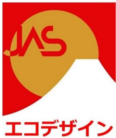
Tokushoku JAS logo