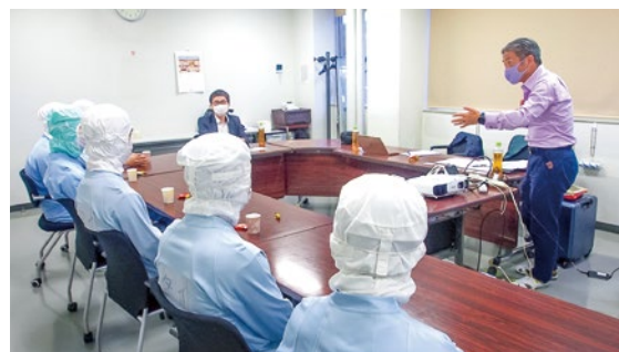
Interview at a food factory