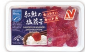
Shio Sujiko (salted sujiko), processed roe from MSC-certified Alaskan sockeye-red salmon