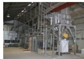
High-speed chicken manure processing plant

Manure from the poultry farm is made into organic fertilizer at an on-site high-speed chicken manure processing plant. This fertilizer is spread over the feed rice paddies, providing nutrients for the soil, where previously they were resting rice fields. Rice harvested from these paddies is fed to Junwakei chickens as formula feed. Moreover, waste heat energy from the manure processing plant is used to heat the chicken coops.