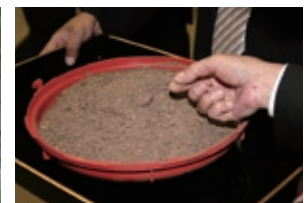
Chicken manure made into organic fertilizer